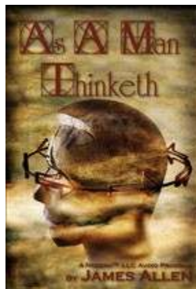
As A Man Thinketh by James Allen